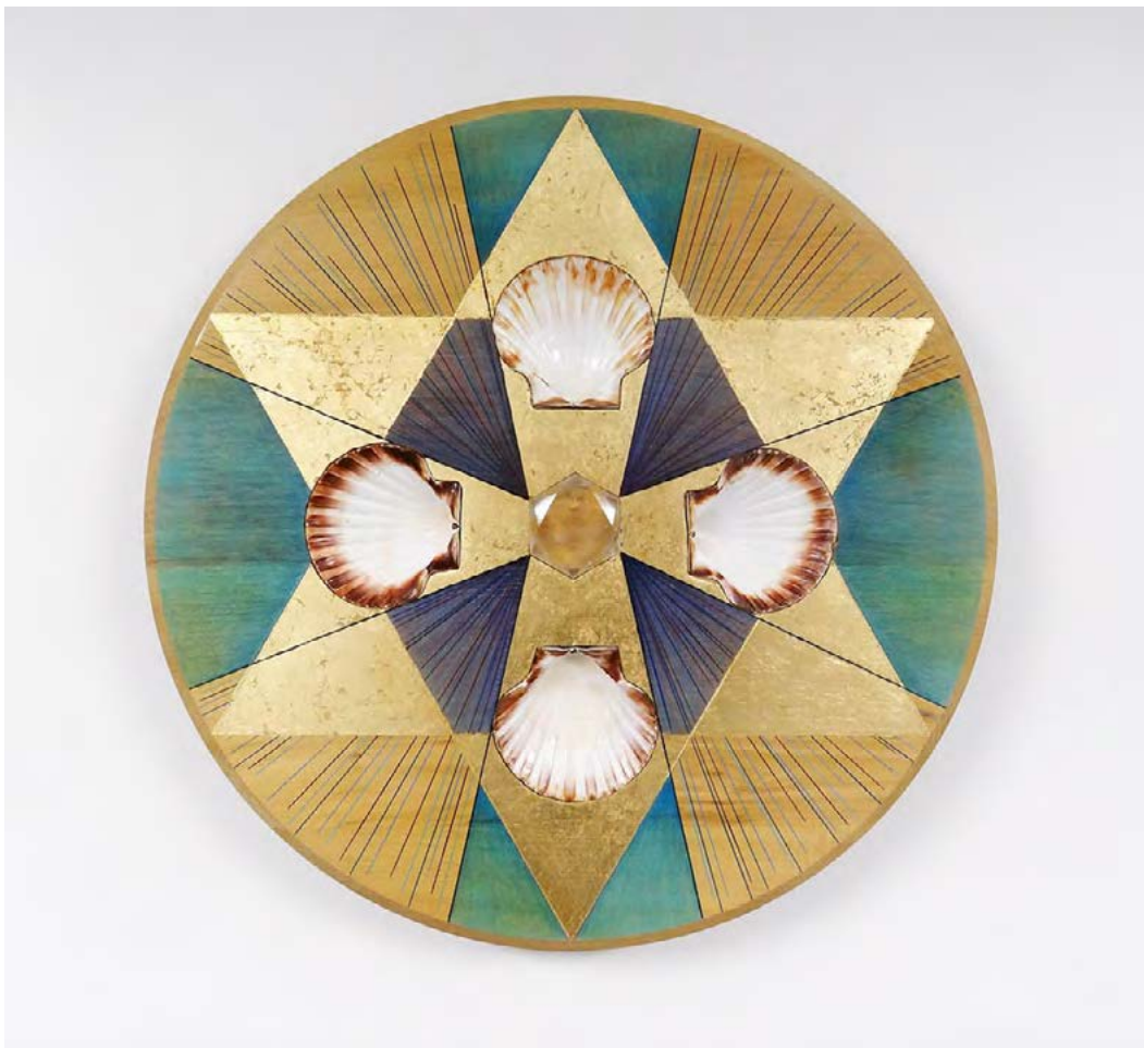
Sandra Lorenzi © rights reserved