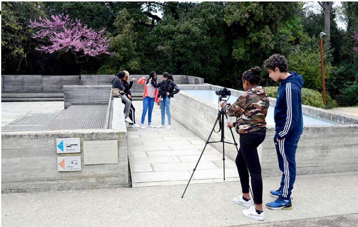
Workshop Cadavre exquis — Association Travail & Emploi, Nice / Association La Semeuse, Nice