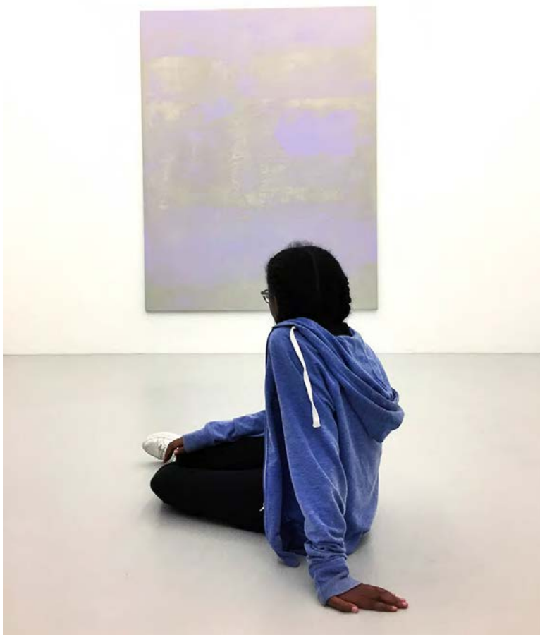
Workshop Cadavre exquis, exhibition Contrepoint Association Travail & Emploi, Nice / Association La Semeuse, Nice