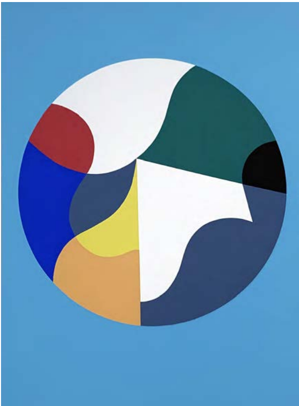
Sophie Taeuber-Arp, Composition dans un cercle , 1957 Sophie Taeuber-Arp Album — Denise René Edition Collection Arcay © rights reserved © Adagp, Paris 2020