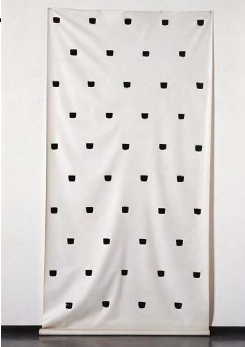
Niele Toroni, Empreintes de pinceau n°50 répétées à intervalles de 30 cm , 1975

FNAC 02-1366 Centre national des arts plastiques Espace de l'Art Concret — Donation Albers-Honegger © rights reserved