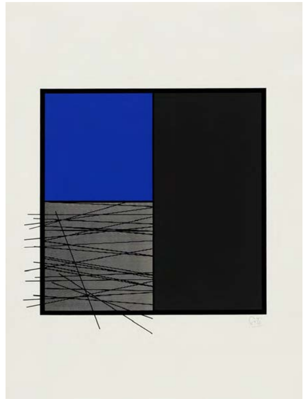
Jesús-Rafael Soto, Sans titre , 1969 Vibrations Album — Denise René Edition Collection Arcay © rights reserved © Adagp, Paris 2020