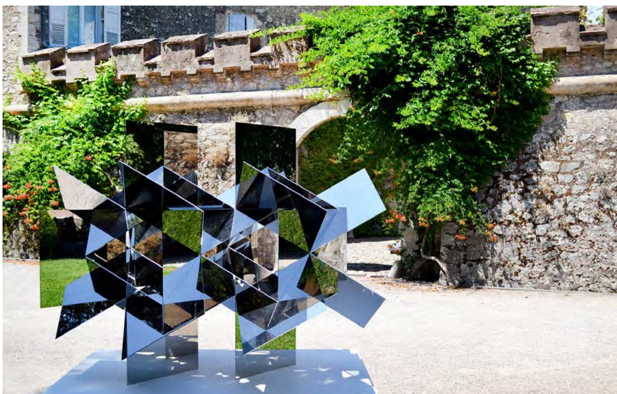
Francisco Sobrino, Structure permutationnelle, 1998 / 2015 Collection Famille Sobrino © Adagp, Paris 2020