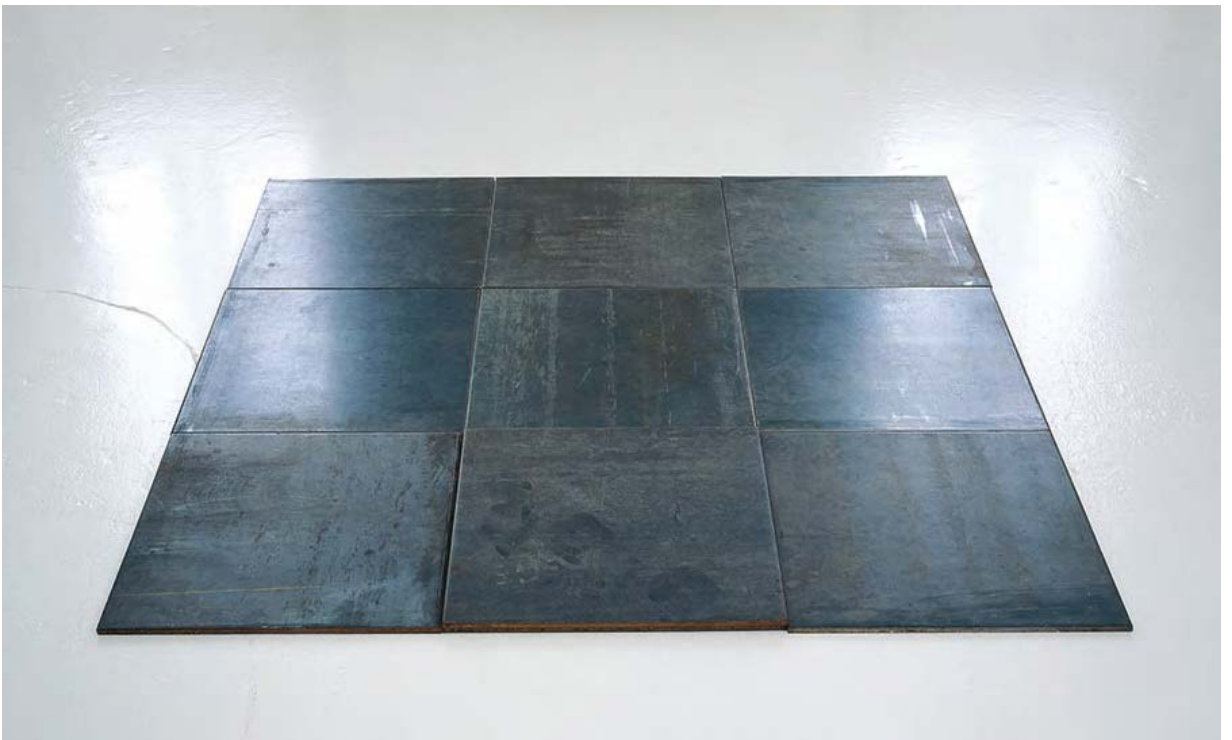
Carl Andre, South Deck , 1993

FNAC 02-1264 Centre national des arts plastiques Espace de l'Art Concret — Donation Albers-Honegger © Adagp, Paris 2020