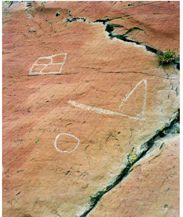
Philippe Durand © rights reserved © Adagp, Paris 2020