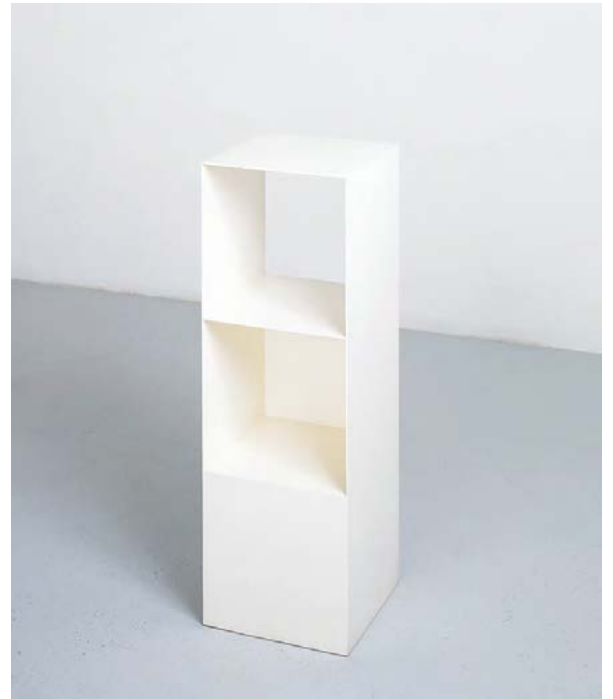
Sol LeWitt, 1, 2, 3 , 1970

FNAC 02-1366 Centre national des arts plastiques Espace de l'Art Concret — Donation Albers-Honegger © rights reserved