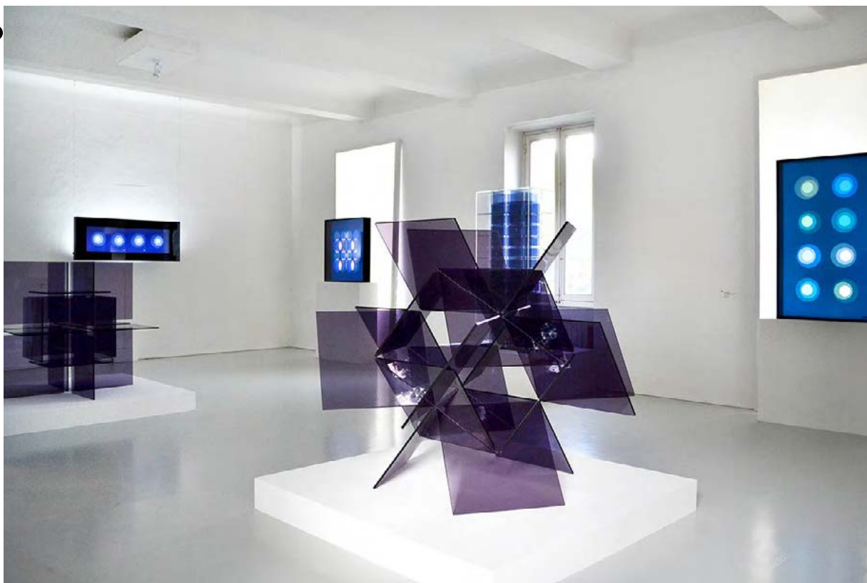
Vue de l'exposition Francisco Sobrino / œuvres de l'artiste Collection Famille Sobrino © Adagp, Paris 2020